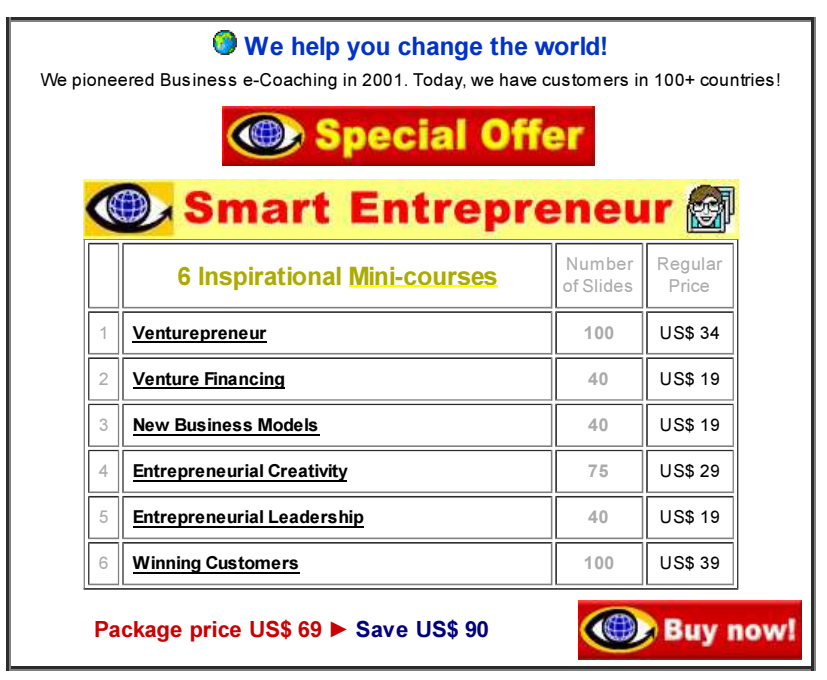
Don't sit on your dreams - make them a reality!